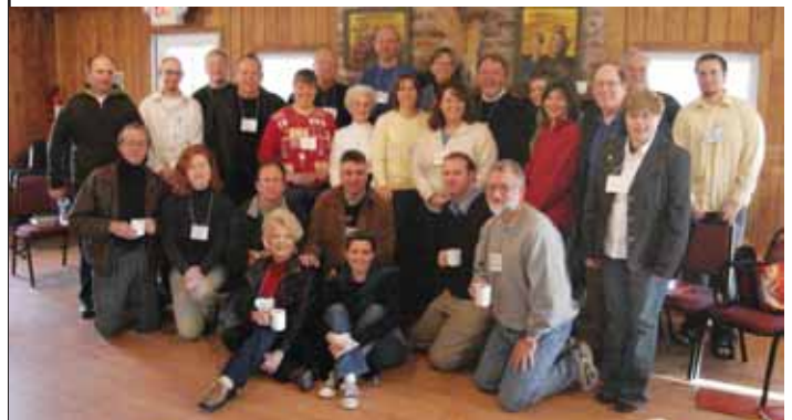
Georgia Disciple Clergy gathered at Camp Christian Conference Center for their Annual Retreat Sponsored by the Christian College of Georgia earlier this month.

For additional information or to reserve a seat for the Clergy Gatherings please call 229-244-1742 or send an email to mcwest@fccvaldosta.org .