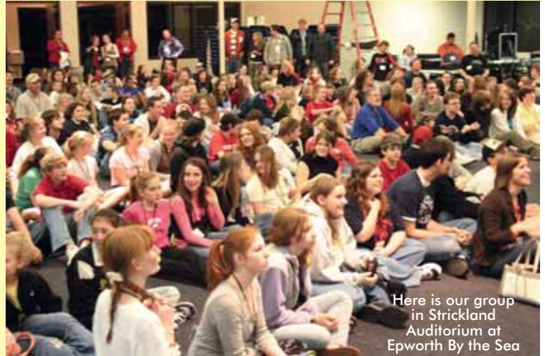
Here is our group in Strickland Auditorium at Epworth By the Sea