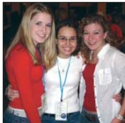
There was plenty of time to renew old friendships