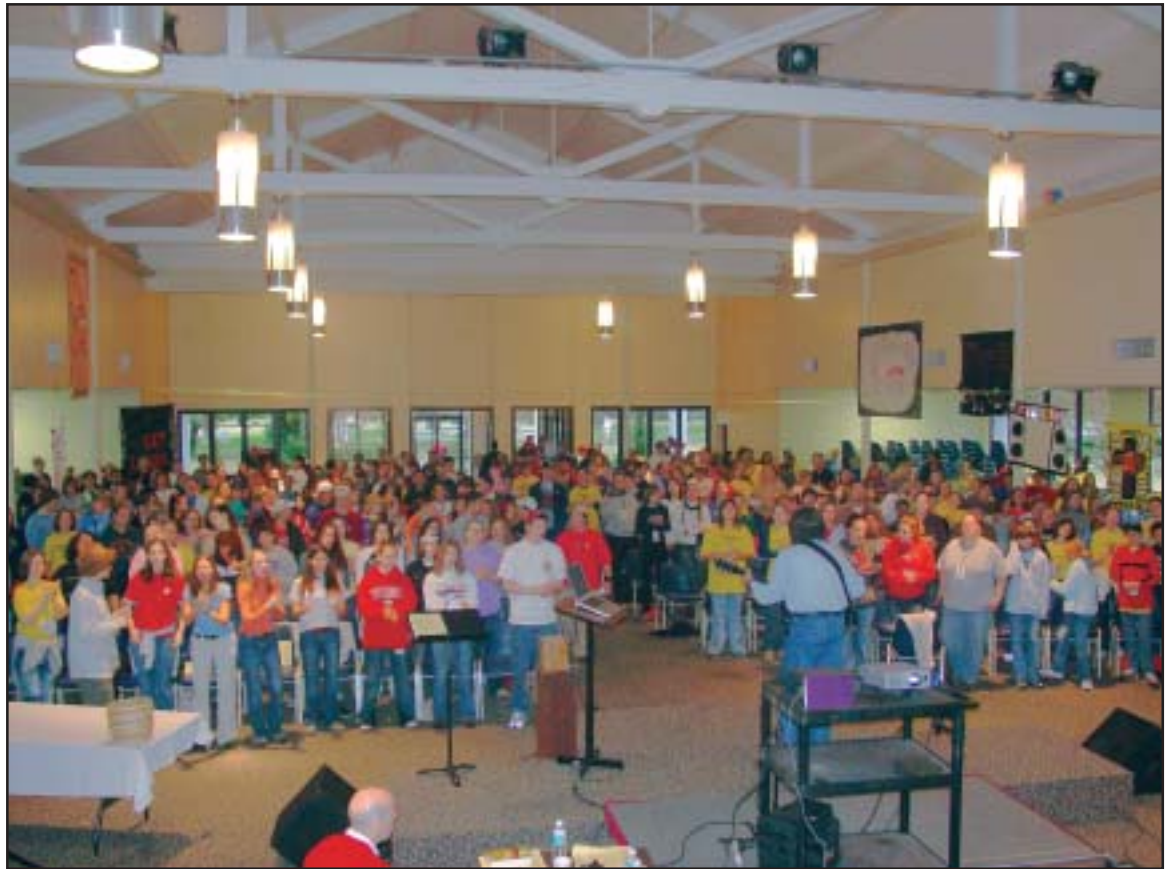
Worship was held each day in Strickland Auditorium.

The friends I make here are polar opposites of the friends I make at home and they allow me to look at God and my faith in a brand new way. They are not afraid to let you know they love God.