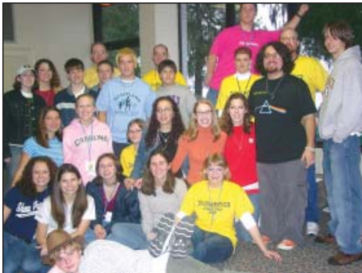
The YAC Pack! Youth Activity Council 2003-2004 planned Youth-A-Palooza.