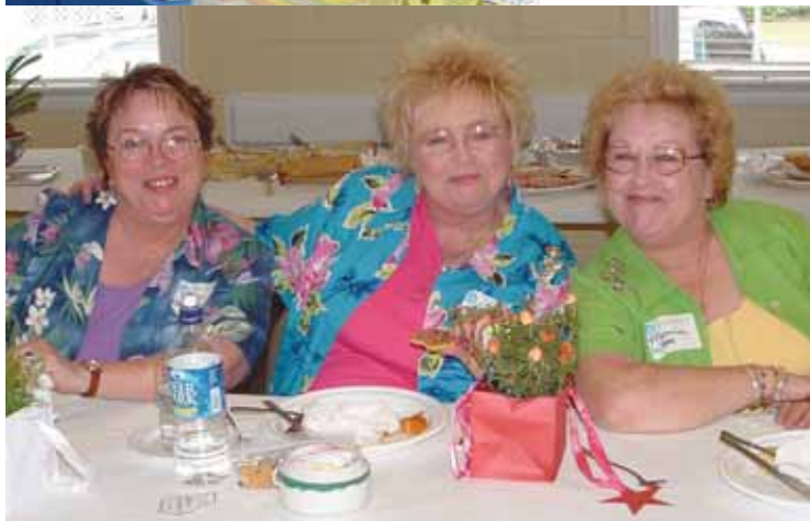
The women of First Christian, Valdosta, hosted the Southwest District conference. Shown here are three of the women from the host congregation.