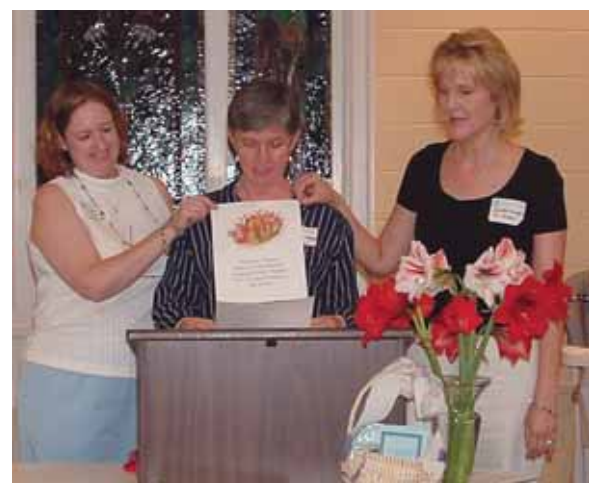
Three women from First Christian, Albany, present a skit promoting the Mix In '06. Mix in '06 will be a national gathering of women from the Christian Church (Disciples of Christ) and the United Church of Christ. The Mix will be held in Indianapolis, June 21-25, 2006.

Each spring, the Women's Commission takes its "traveling road show" to the region's six districts. Women learn about the newest study material, share ideas for ministry, and enjoy worship and fellowship with one another. Conferences this year were hosted by: First Christian of Atlanta, Tucker; Friendship Christian, Athens; St. Andrew, Macon; First Christian, Dublin; First Christian, Valdosta; and First Christian, Glennville.