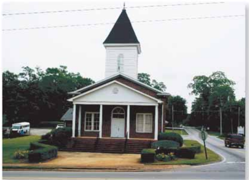
First Christian Church has met at its Main Street location since it was founded in 1897.

First Christian Church is located at 4 North Main Street in Watkinsville. You can visit the church on the web at www.firstchristianwatkinsville.com .