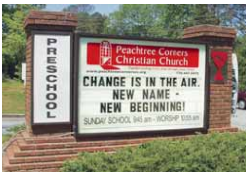
The sign on Spalding Drive in Norcross reflects the new name and renewed purpose of Peachtree Corners Christian Church.

Information about the congregation is available on the church's web site, http://www.peachtreecornerscc.org