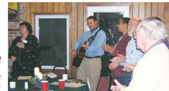
Worship on Friday night included music and celebration.